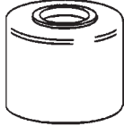
Nylon Umbrella Intake & Exhaust 1973-1991

UMBRELLA TYPE SEAL: Start valve stem seal over valve stem and push seal down on seal body until it touches top of valve stem guide or "boss." The seal will find its proper position on the stem once the engine starts.