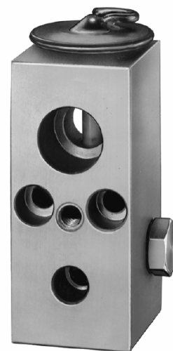
H-Block Expansion Valve

Protect your investment by examining the expansion valve.