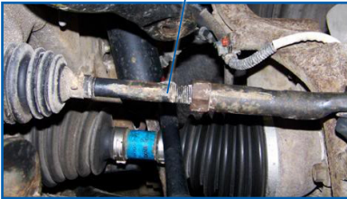
NOTE BROKEN SWAY BAR LINK

The sway bar link on the affected vehicles comes in many styles. Other suppliers may utilize a small-diameter bolt. This small size makes the bolt susceptible to the damaging effects of road shock and corrosion. In addition, the neoprene bushings used in many of these links do not stand up well to stress and weather conditions. Also, other suppliers may use a rolled steel sleeve which can allow contaminants in, leading to corrosion and failure.