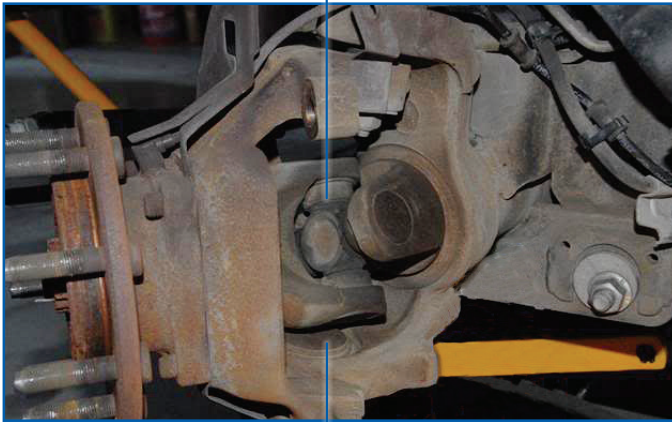
NOTE LIMITED CLEARANCE