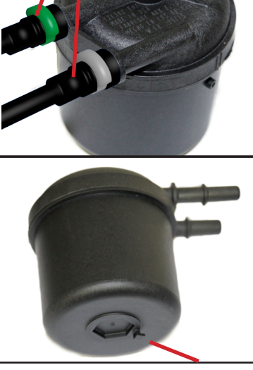
Loosen filter cradle bolt and twist filter slightly to unseat from cradle.

To service secondary filter, first disconnect fuel lines from filter ports.