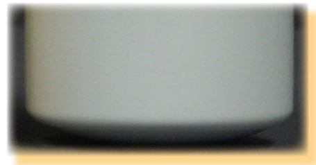
51607 Non Fluted Can