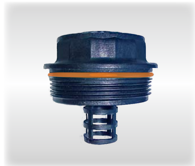
Figure 2.0 The oil filter housing lid with O-ring properly installed (highlighted in orange for demonstration purposes only)